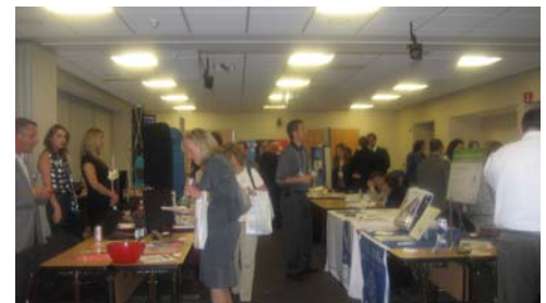
Above: Sponsors and Exhibitors at 2011 Annual Event Below: Thanks to all our volunteers for helping with registration